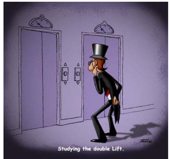
Studying the double lift.

Why don't you try the trick again and pick a new number this time?